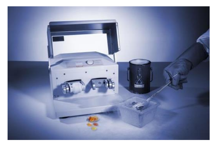
Fig. 5 Cryogenic grinding

WARNING: When working with liquid nitrogen please consider the specific safety precautions.