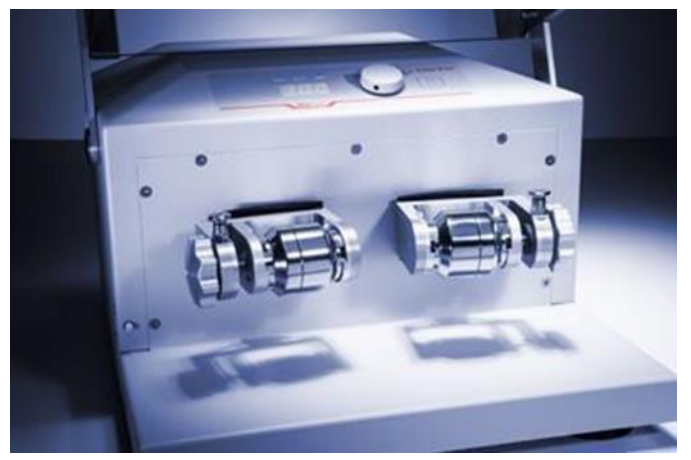
Fig. 4 Simultaneous operating grinding jars

The Ball Mill BM500 can be operated in simultaneous mode. Two jar holders can be filled with jars and samples in parallel. This is beneficial if there is the need for a higher sample amount at once or for a backup sample for safety reasons.