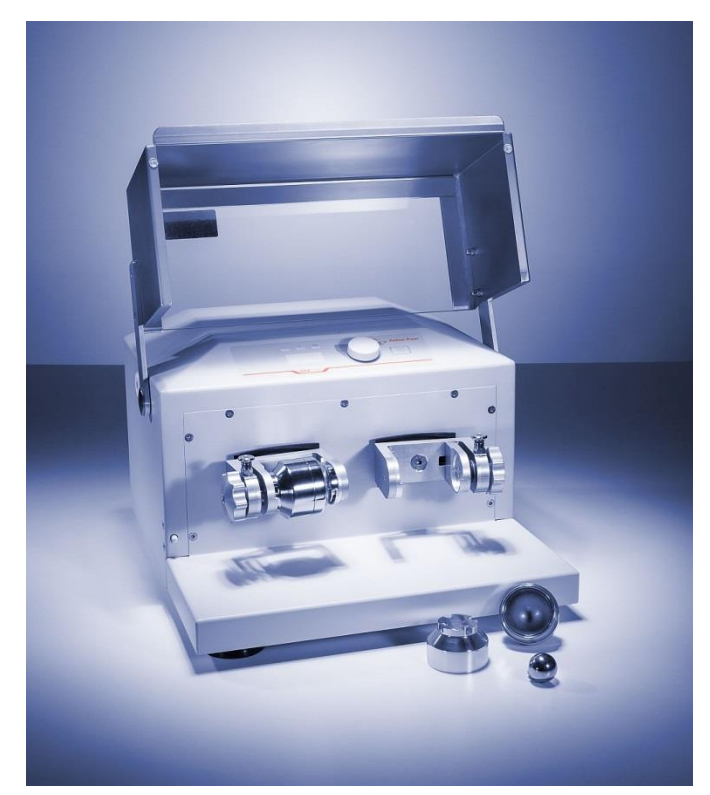
Fig. 1 Ball Mill BM500

Anton Paar's Ball Mill BM500 is a versatile laboratory ball mill. With its simplified handling principle it enables the quick processing of dry, wet and even cryogenic milling procedures.